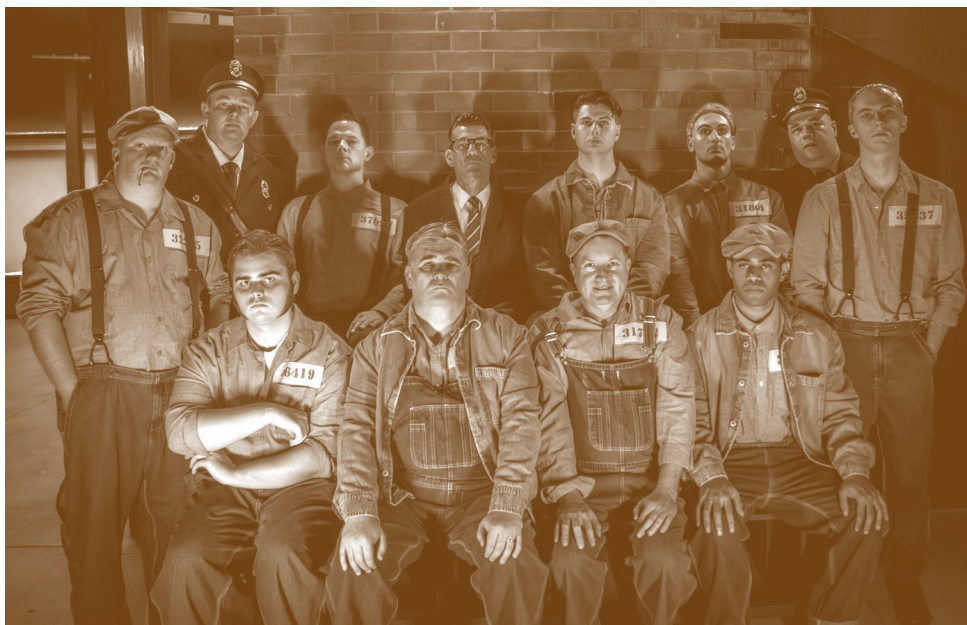
The full cast